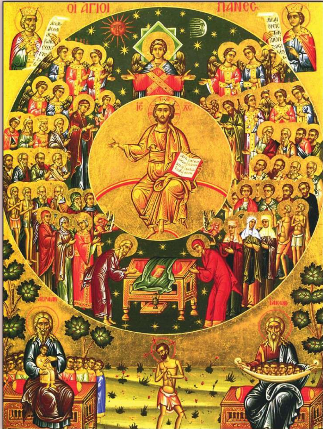
Icon of All Saints