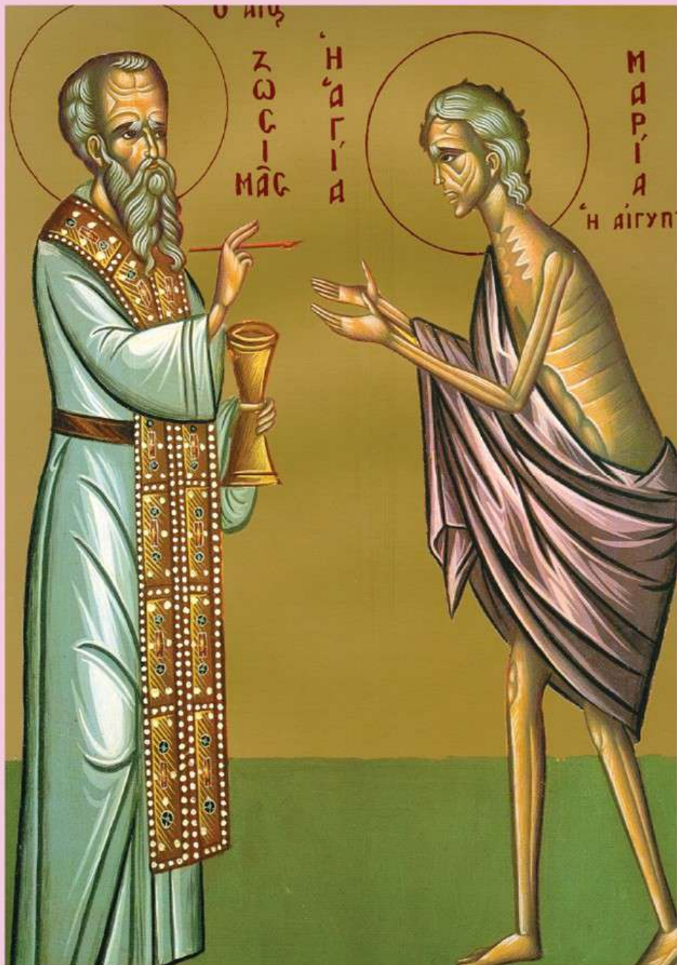
Icon of Saint Mary and Saint Zosimos