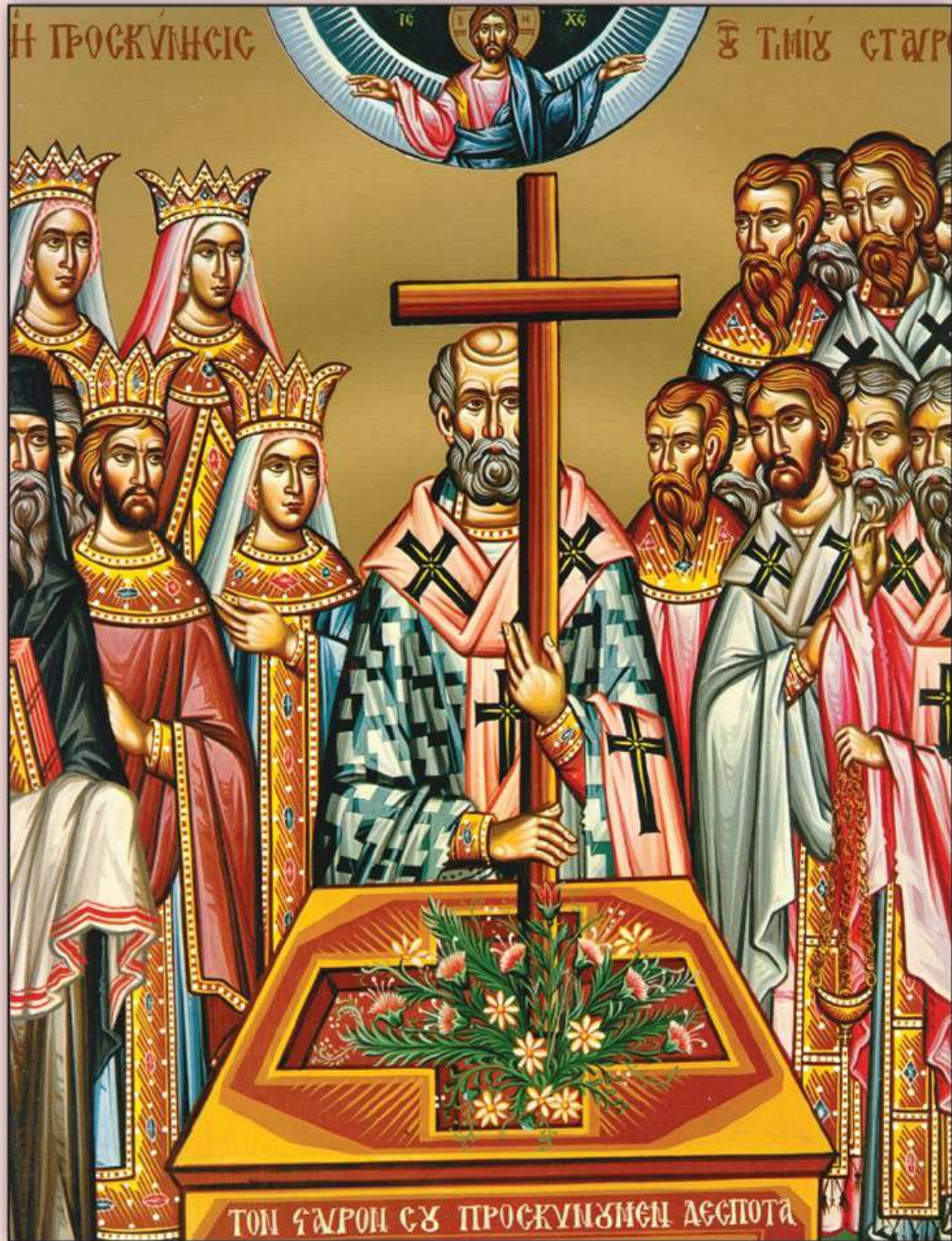
Icon of the Sunday of the Holy Cross