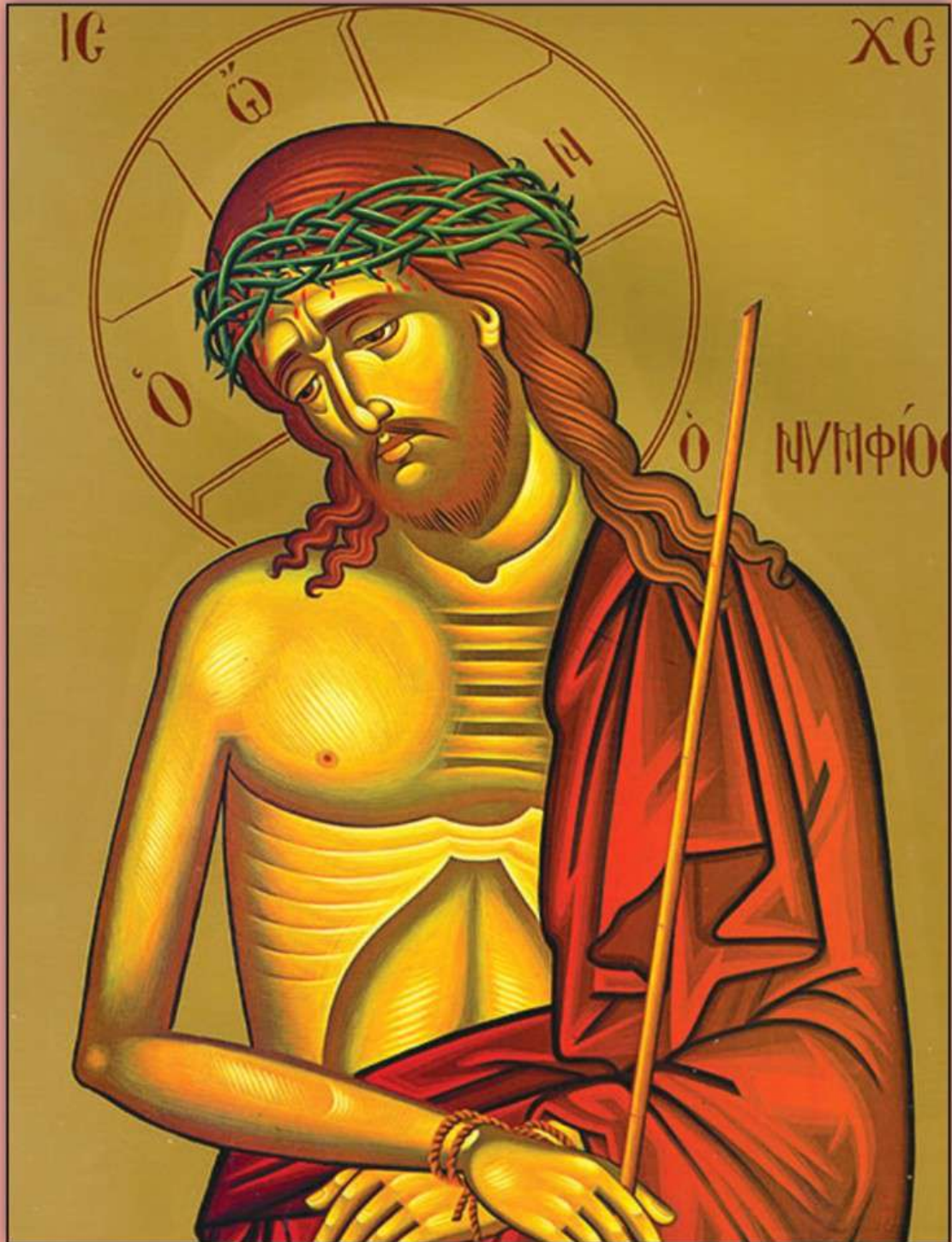
Icon of Christ the Bridegroom